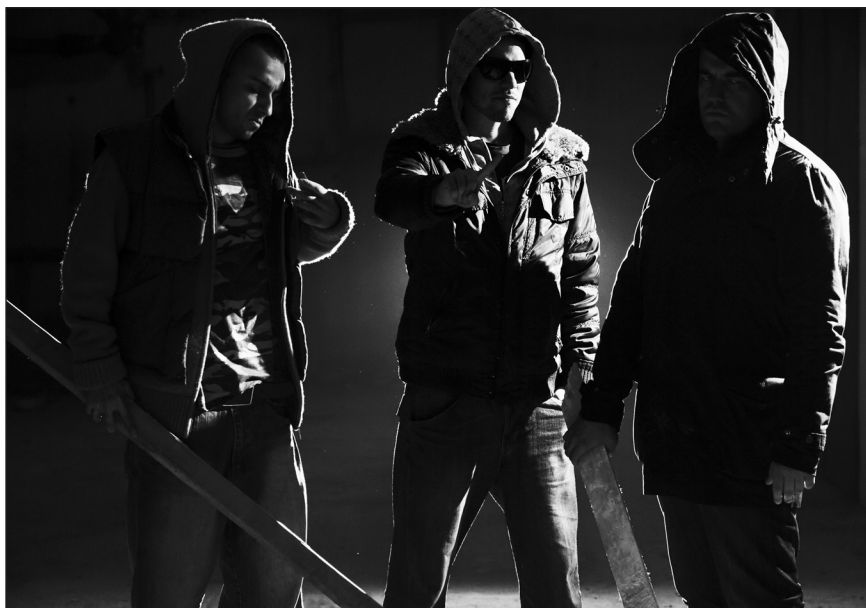
An argument that disparity of force existed may be used when multiple assailants attack.

Legally speaking, likely it was lawful for the defender to use force in self defense, but in court the claim is made that he or she used excessive force. Under these circumstances, the defendant will need to show the jury, or a judge if the case is