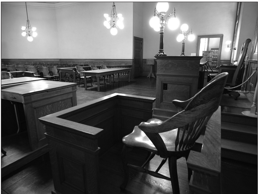
Sitting in the witness' chair and at the defendant's table in a courtroom is one of the possible outcomes of being involved in a self-defense shooting.

These are only some of the reasons gun owners must understand when it is justifiable to use deadly force in self defense, as well as learning what to expect from the legal system if they are left with no viable alternatives and must shoot an attacker.